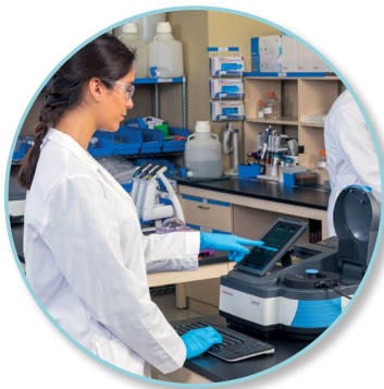
Thermo Scientific™ BioMate™ 160 UV-Vis Spectrophotometer