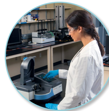
GENESYS 40 Vis/50 UV-Vis Spectrophotometers