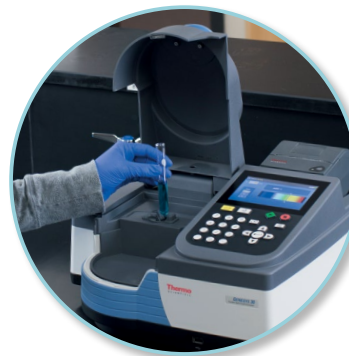
GENESYS 30 Visible Spectrophotometer

For teaching labs, research labs and industrial QC requiring robust construction, ease-of-use and software capability.