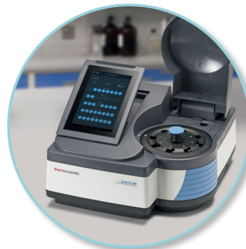
GENESYS 180 UV-Vis Spectrophotometer