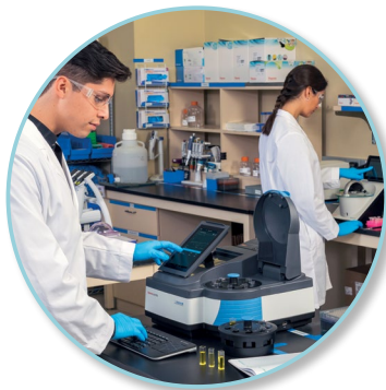
GENESYS 140 Vis/150 UV-Vis Spectrophotometers

For advanced teaching labs, R&D, research and life science applications requiring higher throughput or temperature control.